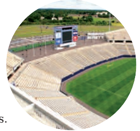
Rentschler Field: Home to the UCONN Huskies Football Team.

(Madison Square Garden & the University of Connecticut)